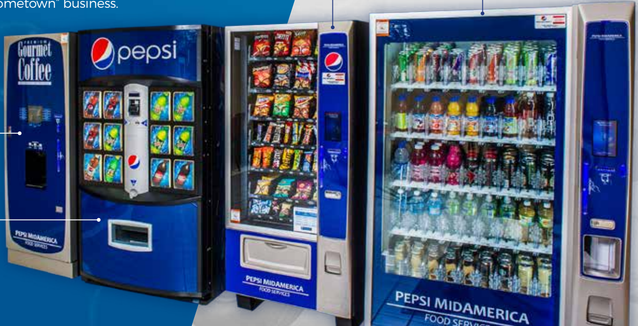
SOFT DRINK VENDOR